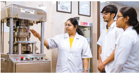
Pilot Plant (A small scale manufacturing Unit)