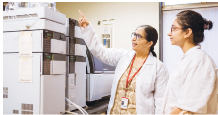
LC-MS/MS (Liquid Chromatography / Mass Spectrometry)