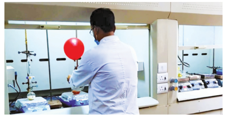
Cell Culture Facility – Research Facility