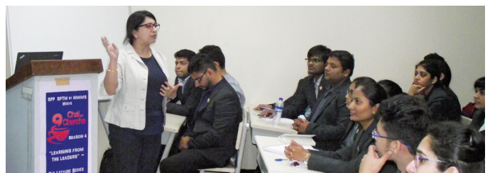
Chai Pe Charcha