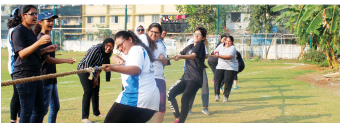
Excaliber Sports Event