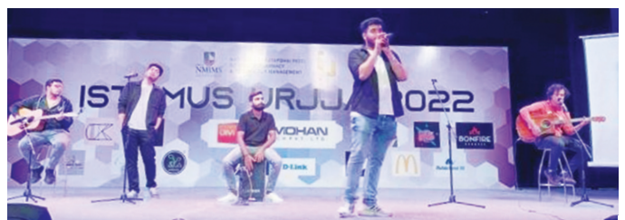
Isthmus (Corporate Event) – Urjja (Cultural Event)